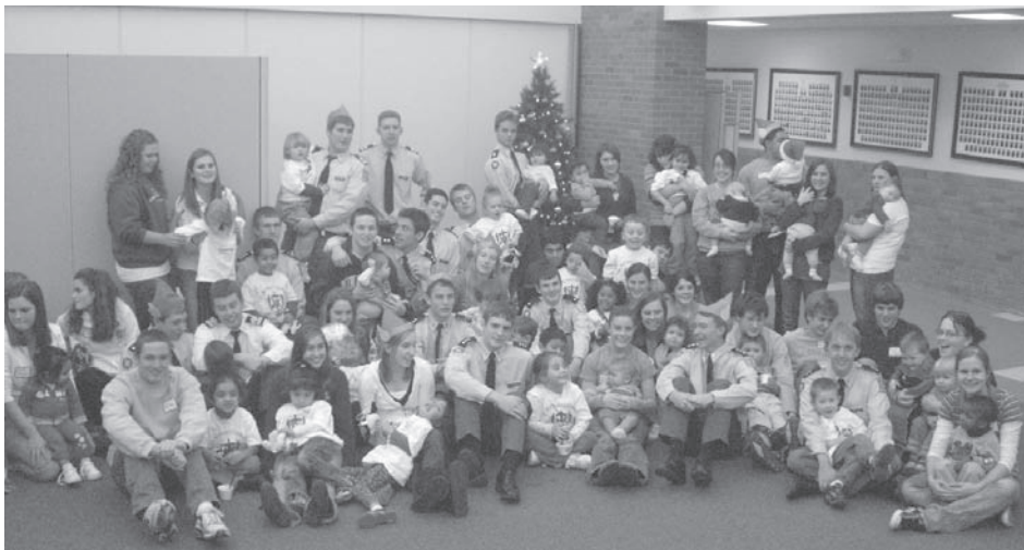
Fun was had by all at the 25 th annual Children's Christmas Party.

The Wilder Foundation's Child Development Center in St. Paul's Frogtown neighborhood offers CDH students and staff the opportunity to help care for and play with children