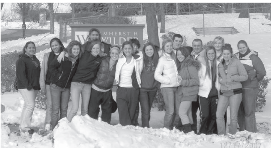
Students helped care for children at the Wilder Foundation's Child Development Center.

All students, staff, parents and guardians are invited to participate in