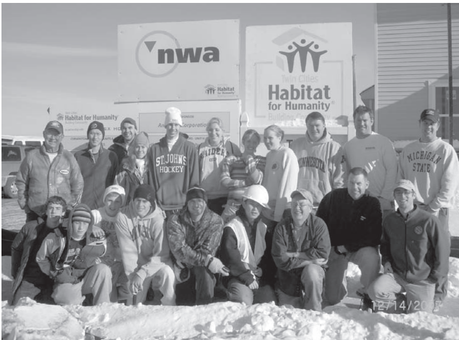
Students, staff and alums at a Habitat for Humanity site in Woodbury, MN.

and learn about the families and children served. The Wilder Center specializes in integrating children with special developmental or behavioral needs into mainstream child care and school environments.